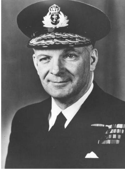
Vice-Admiral Wallace Bouchier CREERY, CBE, CD Vice-Chief of the Naval Staff (0-16700)