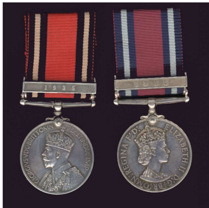
King's Medal for the Canadian Army 1935 Queen's Medal for the RCAF 1955

As a Flight Lieutenant in the RCAF, he won the RCAF Queen's Medal in 1955.