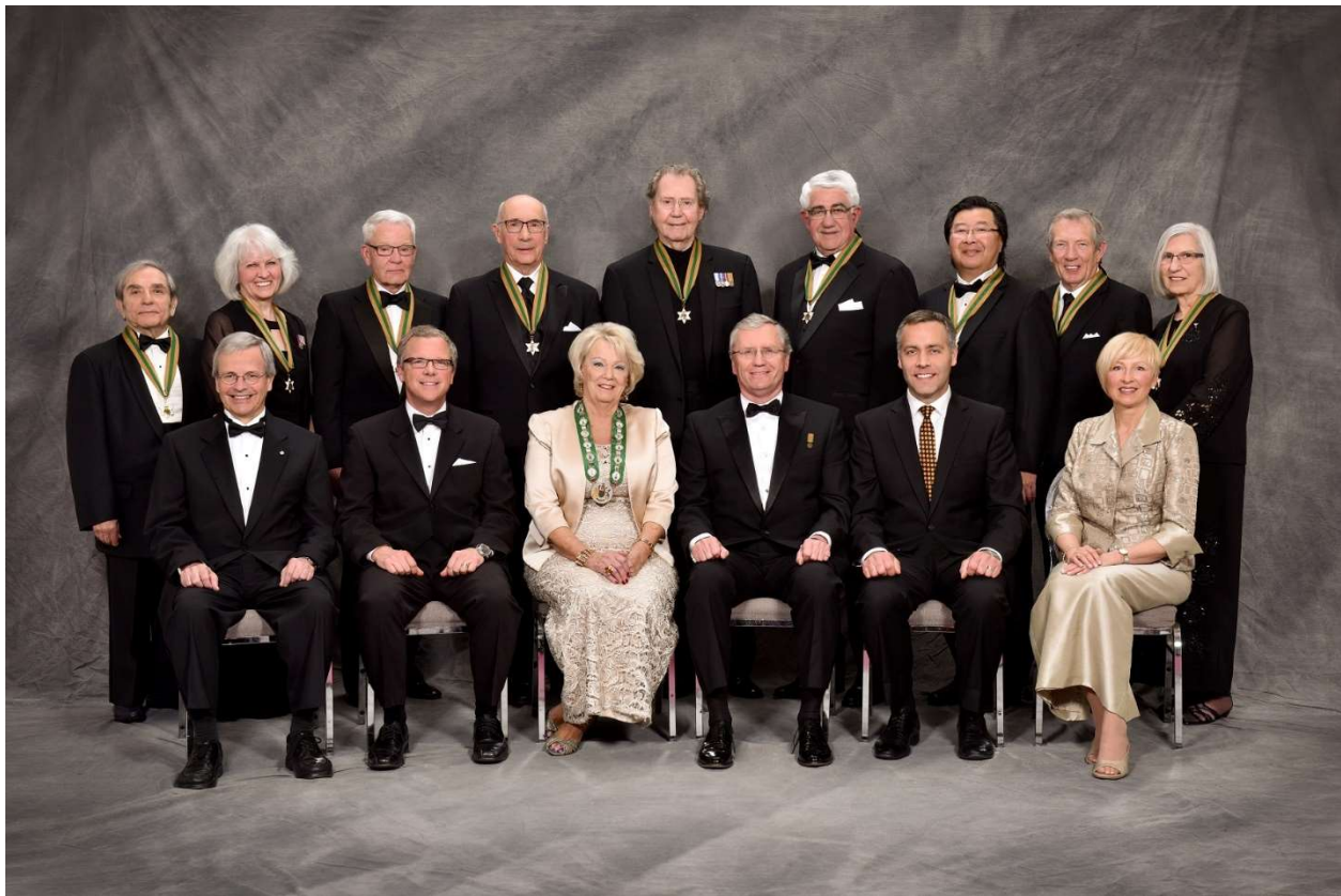
2014-2015 recipients of the Saskatchewan Order of Merit