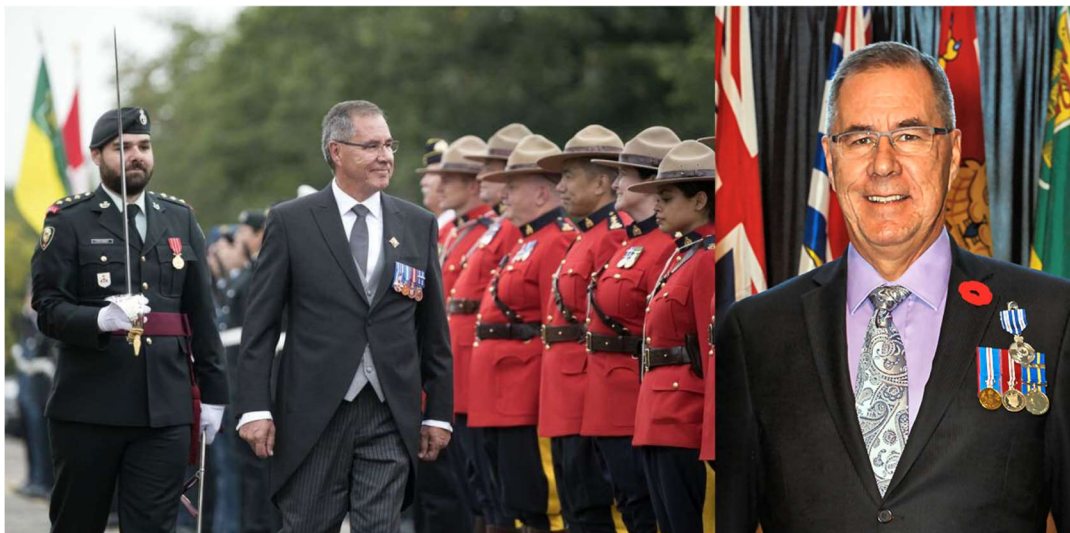
Lieutenant-Governor, The Honourable Russell Mirasty, KStJ, SOM, MSM Former Assistant Commissioner – Royal Canadian Mounted Police