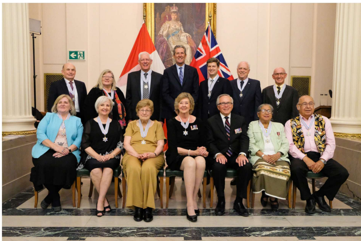
Order of Manitoba Recipients 2019