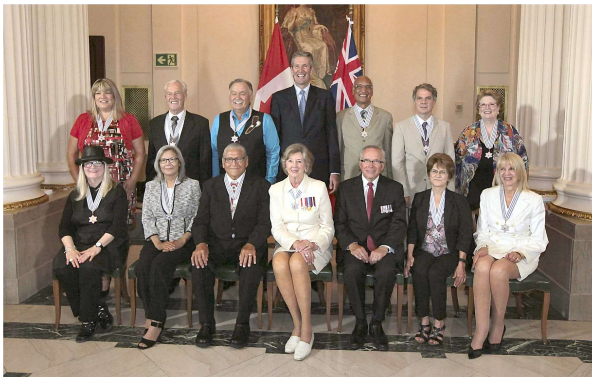
Order of Manitoba 2016