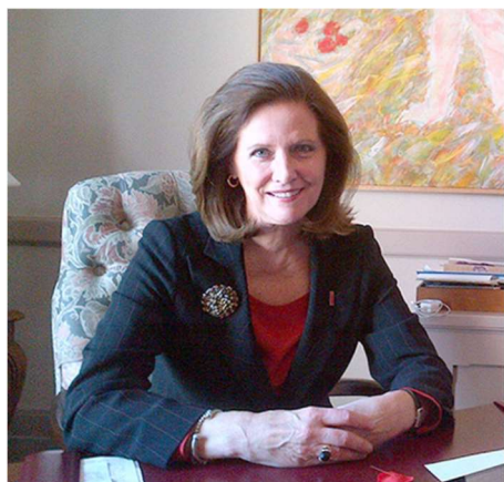
The Honourable Janis Johnson, PC, CM, OM