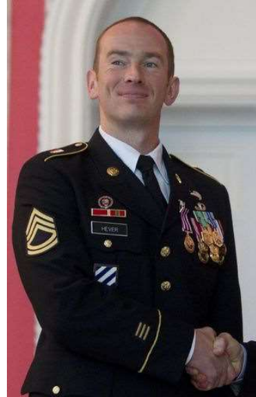
Graves receiving MMV from GG 13 November 2012 at left.

Hever’s Medals: 8 including Army Commendation Medal and the Medal of Military Valour (Photo at right)