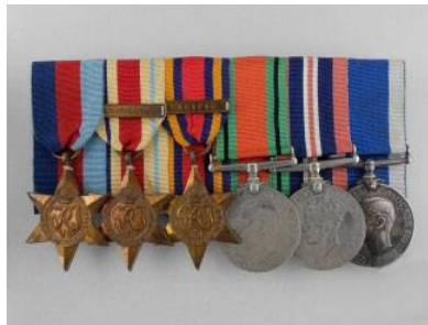
Medals of CPO1 Roger Unwin, RCN LS&GC Medal (CD)