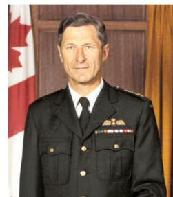
LGen Charles Theriault, CMM, OSTJ, CD