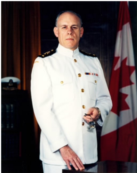
Rear-Admiral Nigel Brodeur, CMM, CD