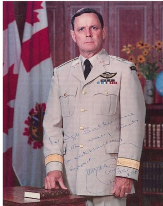
BGen John de CHASTELAIN, CMM, OC, CH, CStJ, CD