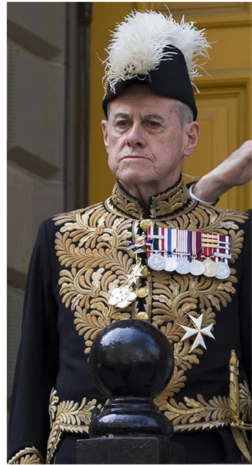
Brigadier-General The Honourable John James Grant, CMM, KStJ, ONS, CD While serving as the Lieutenant-Governor of Nova Scotia