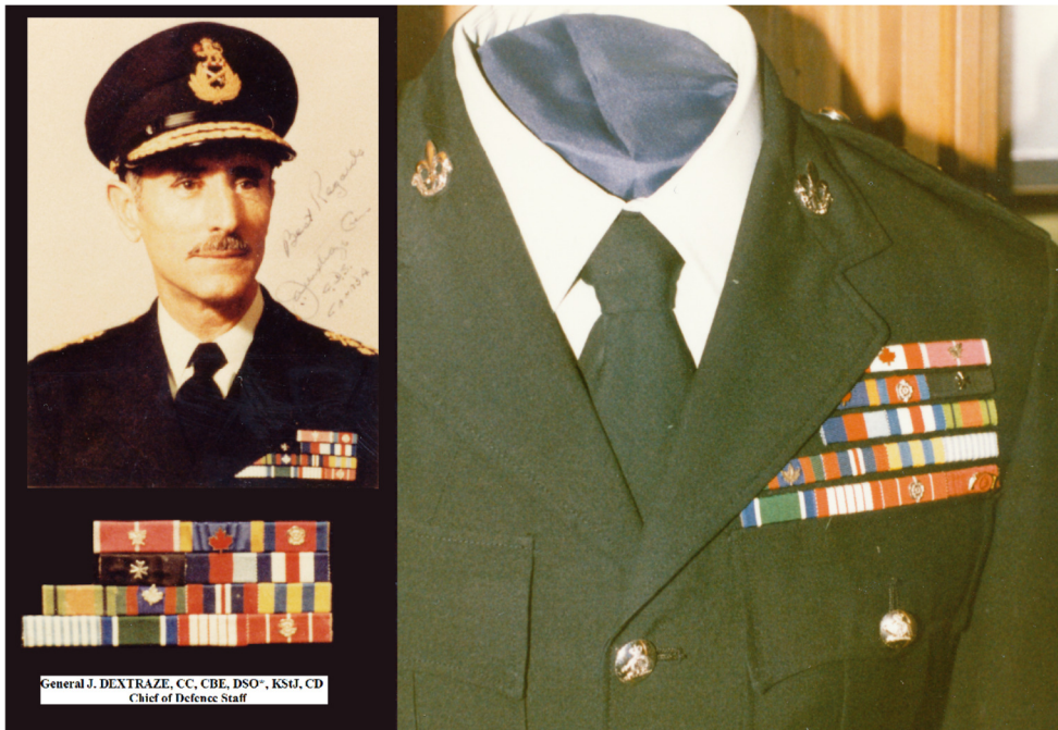
General J. DEXTRAZE, CC, CBE, DSO*, KSJ, CD Chief of Defence Staff