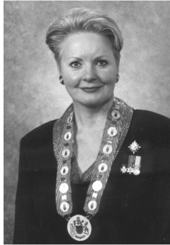
Honourable Lynda Haverstock, DStJ, SOM, SVM