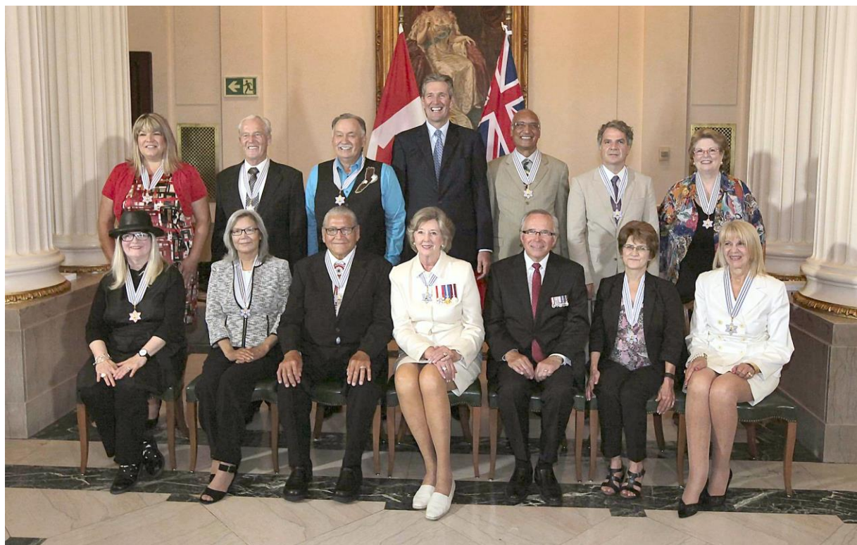
Order of Manitoba 2016