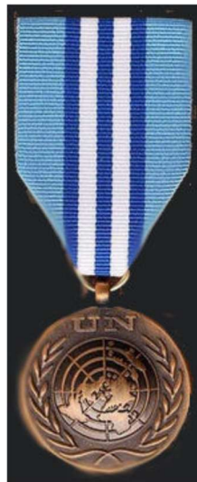
UNMIS (UN Mission Sudan)