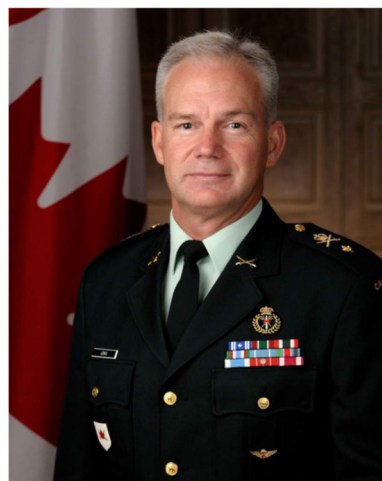
Brigadier-General Frederick LEWIS, MSM & Bar, CD Joint Task Force Central / Land Force Central Area Commander

Medals: MSM and Bar – General Campaign Star with SWA ribbon – Operational Service with Expedition ribbon – SSM with bar NATO – Peacekeeping – UN Lebanon (UNTSO) plus 2 nd tour numeral – UNPROFOR – UN SSM with bar Cambodia Mine Action plus 2 nd tour numeral – EIIR Diamond Jubilee - CD and 2 Bars – MSM (USA)