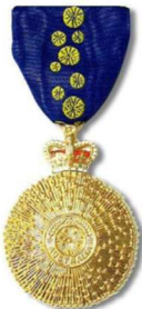
Member of the Order of Australia (AM)