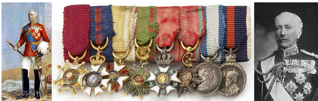
Miniature Medals of Field Marshal, Viscount Wolseley, GCB, GCMG