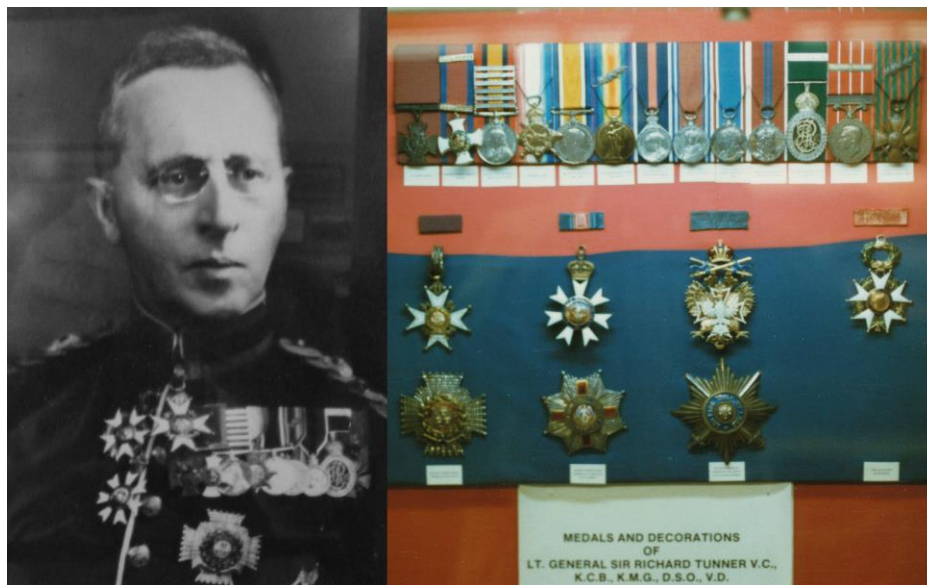
Medals of Lieutenant-General Sir Richard Ernest William Turner, VC, KCB, KCMB, DSO