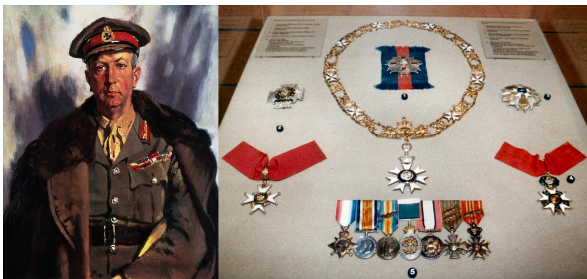
Medals of General Sir Arthur William Currie, GCMG, KCB