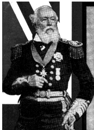
Admiral-of-the Fleet Sir Provo William Parry Wallis, GCB, RN 98 years in the Royal Navy – Longest serving Admiral-of-the-Fleet in the RN History